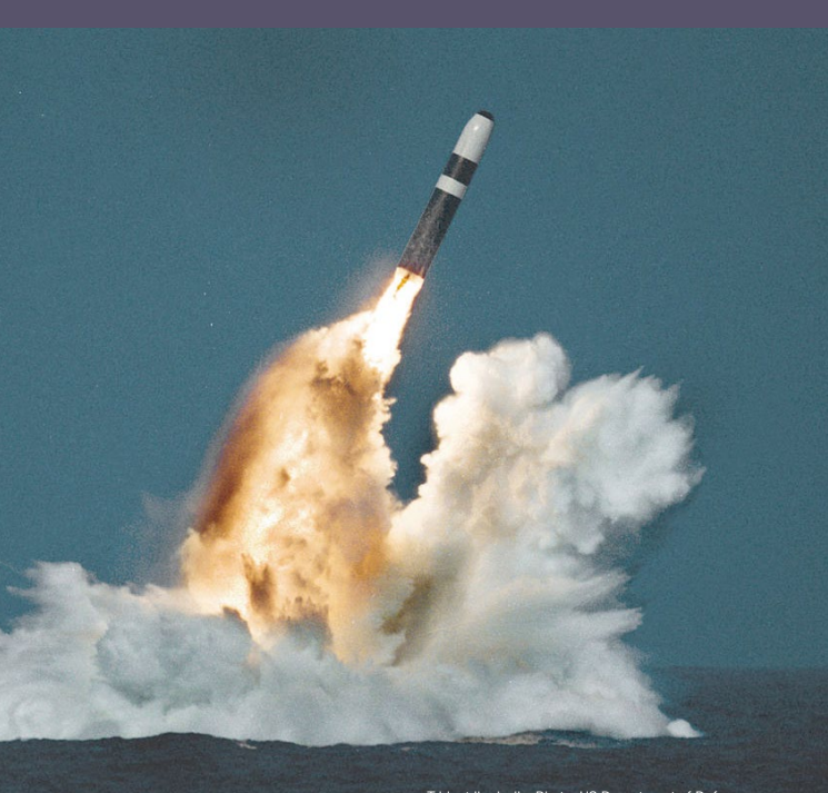
Trident II missile.