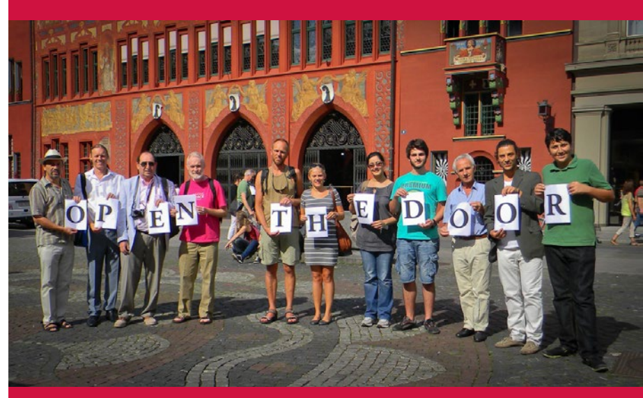
Ambasador Manuel Dengo, Chair of the UN Open-Ended Working Group on Taking Forward Multilateral Nuclear Disarmament Nanotiations, with students from the World Page Academy

In preliminary deliberations, the OEWG opened up new approaches to nuclear disarmament and bridged differences that have stymied the Conference on Disarmament—particularly the conflict between the step-by-step and comprehensive approaches. The OEWG has explored compromise approaches such as concurrent work on both building blocks and a roadmap or framework for a nuclear weapon–free world. This could indeed open the door to a nuclear weapon–free world.6