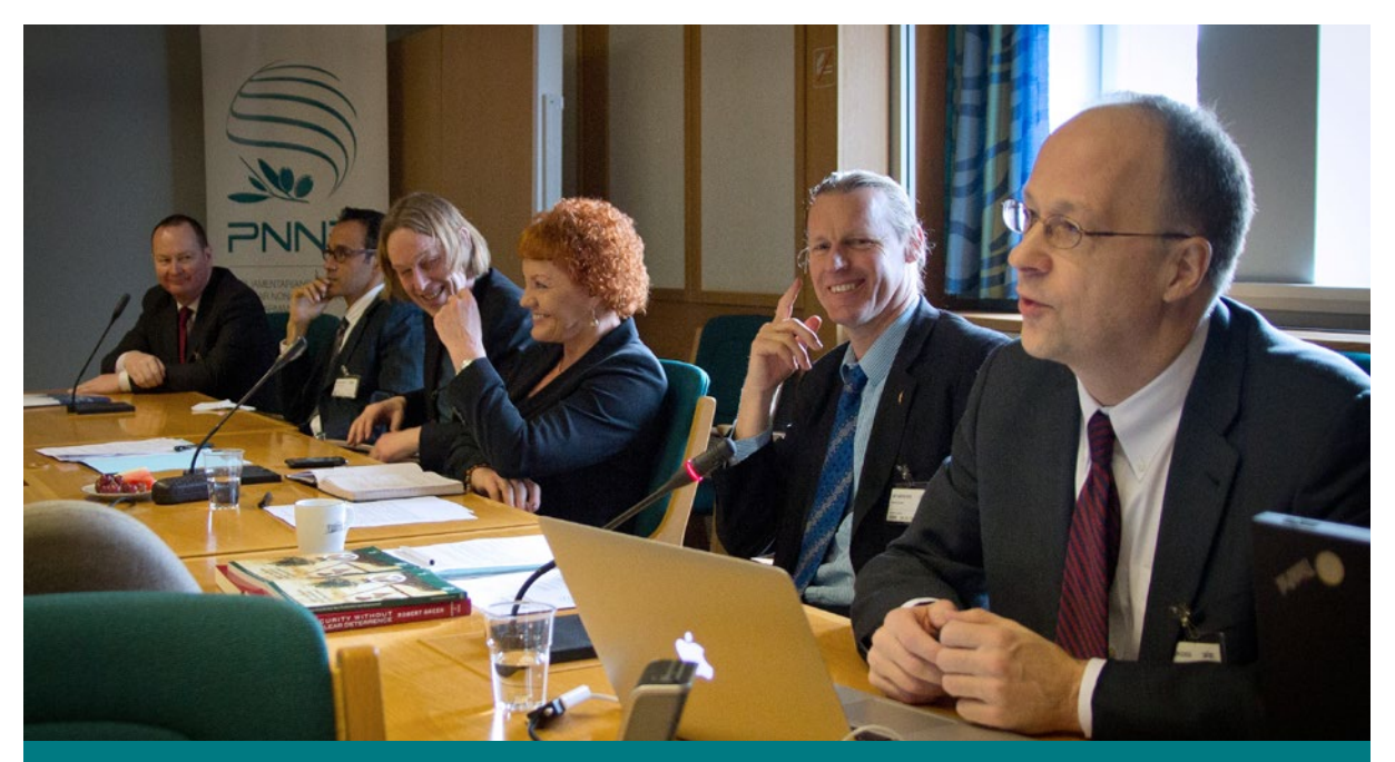
Seminar in the Norwegian Parliament held in conjunction with the 1st International Conference on the Humanitarian Consequences of Nuclear Weapons.

PNND members have organised a range of actions and events to commemorate the International Day for the Total Elimination of Nuclear Weapons (September 26), including parliamentary debates, motions and joint appeals, social media actions and special screenings of the movie The Man who Saved the World .